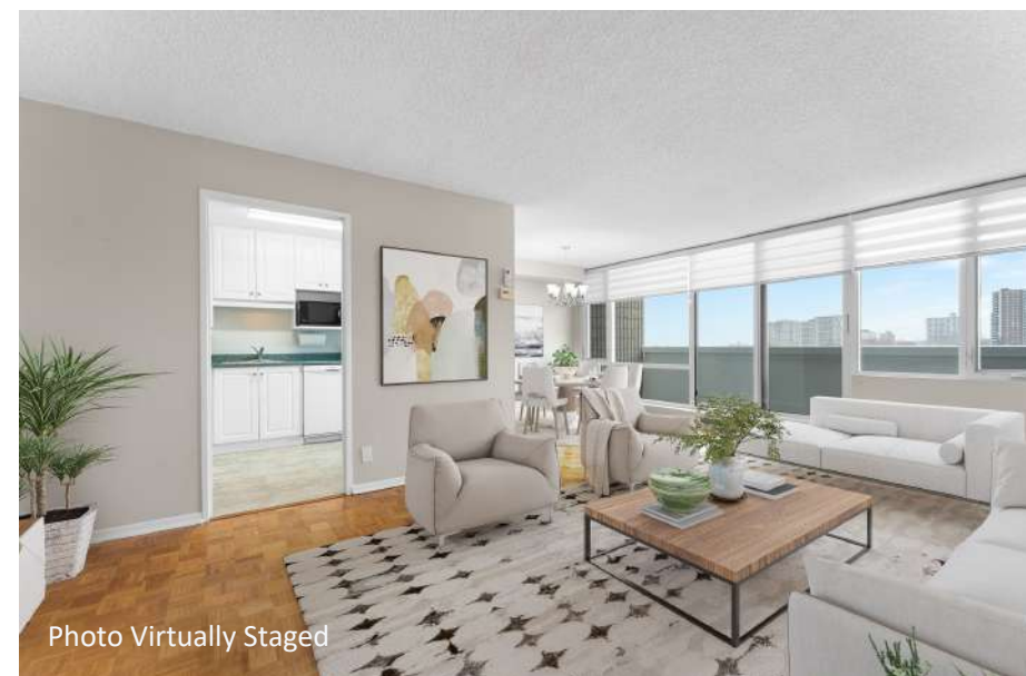
Photo Virtually Staged