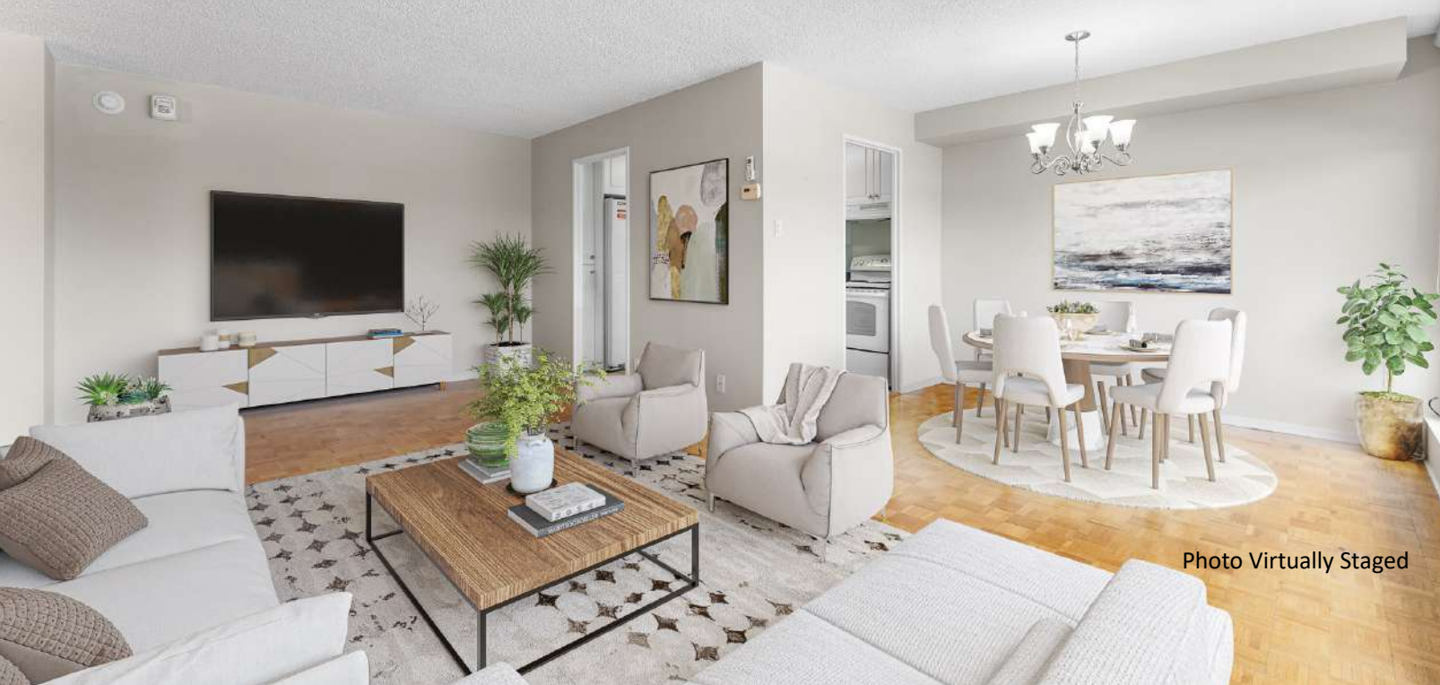
Photo Virtually Staged